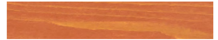
210-056 sanddorn ■ sea buckethorn ■ argousier rojo gayuba ■ olivello spinoso ■ tindvedrod