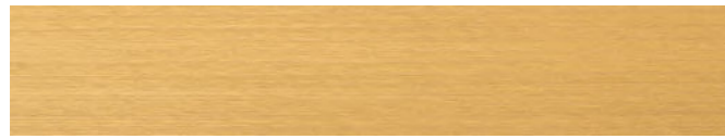
210-032 pinie ■ pine ■ pin parasol pin pinonero ■ pino ■ pinje