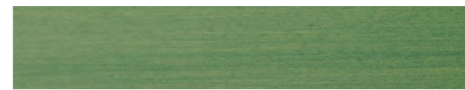
210-418 *avocado ■ avocado ■ avocat aguacate ■ avocado ■ avokado