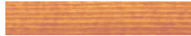
210-273 honigton-rötlich ■ dark honey ■ miel roux miel rojiza ■ rosso miele ■ rød honning