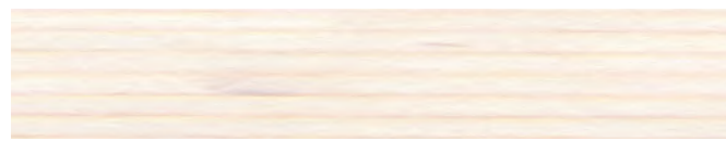
210-202 *weiß ■ white ■ blanc blanco ■ bianco ■ hvit