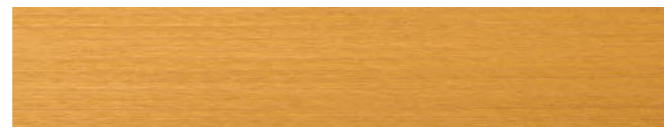
210-012 *kiefer ■ spruce ■ pin pino ■ pino ■ furu