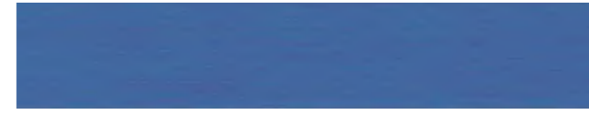
210-126 kornblume ■ cornflower ■ bleuet azul aciano ■ azurro pervinca ■ kornbloms