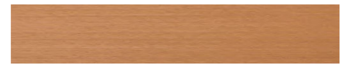
210-042 teak dunkel ■ dark teak ■ teck foncé teca oscura ■ teak scuro ■ mørk teak