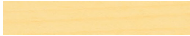
210-203 *hell ■ light ■ clair claro ■ chiaro ■ lys