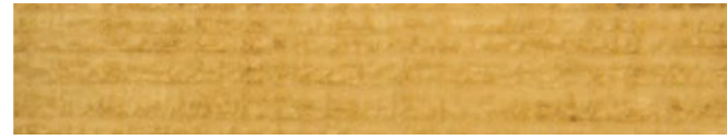
210-076 eiche ■ oak ■ chêne roble ■ quercia ■ eik