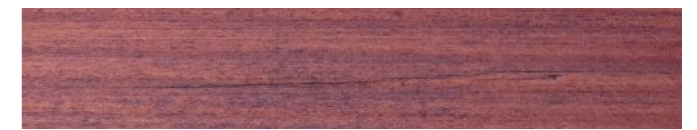
210-134 *flieder ■ lilac ■ lilas lila ■ lillá ■ syrin