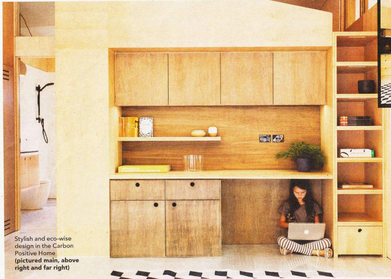
Stylish and eco-wise design in the Carbon Positive Home (pictured main, above right and far right)